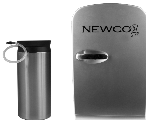
Milk Thermos 152817